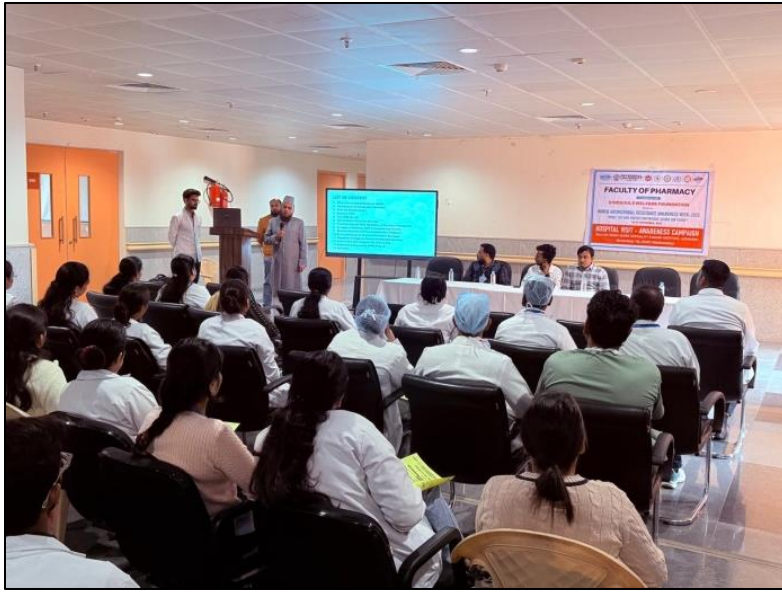
Awareness Campaign at Kalyan Singh Super Specialty Cancer Hospital, Lucknow