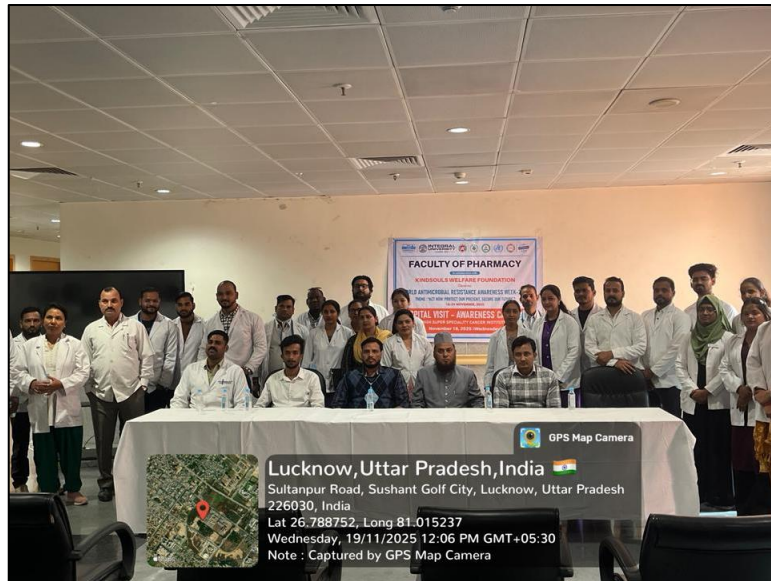
Awareness Campaign at Kalyan Singh Super Specialty Cancer Hospital, Lucknow